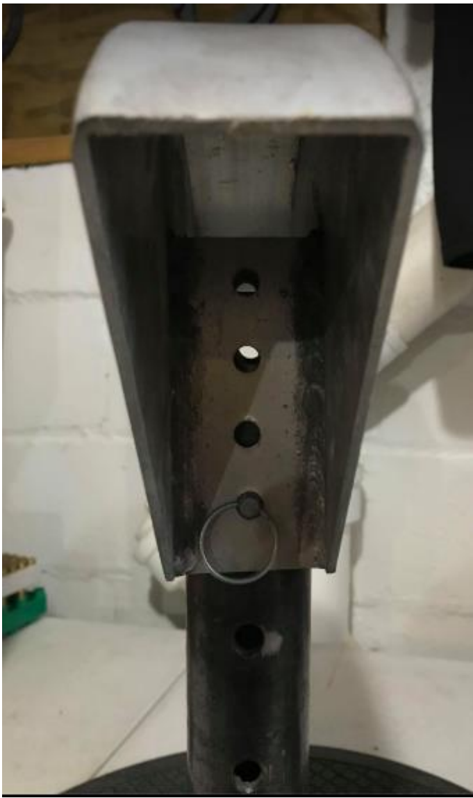
FBBC Omni Pin