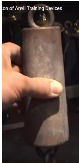
Old version (DO NOT USE)

The Little Big Horn is to be attached to the loading pin with a carabiner. It cannot be attached directly to the loading pin (i.e. not in the way that the Flask is attached to the loading pin). The lifter grips the Little Big Horn with one hand (no part of the hand can grasp below the rim). The lifter will lift the Little Big Horn until the crossguard comes in contact with the crossbar for a 6" lifting height. If the lifter misses contact with the crossbar, the lifter will still need to have the top of the crossguard cross the plane of the crossbar, referee's discretion will be used to judge whether the correct height was attained.