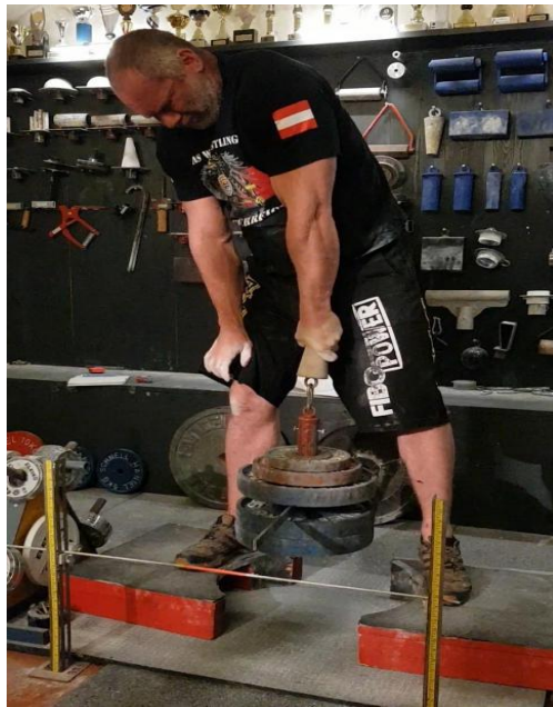
Example Block to stand on.