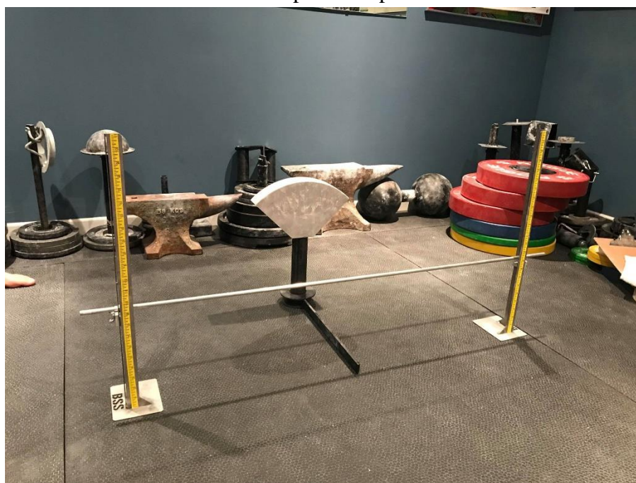
Example Set-Up 2

The following sections will discuss the support equipment for the event. Moving forward the loading pins and crossguard will not have a specific requirement but a set of guidelines that must be followed. The uprights and crossbar/crossguard allow for a great deal of freedom for the promoters. Promoters may choose to use an adjustable crossguard or an adjustable crossbar. Either method of judging height can be used for King Kong as long as the specific event's lifting height can be accurately gauged.